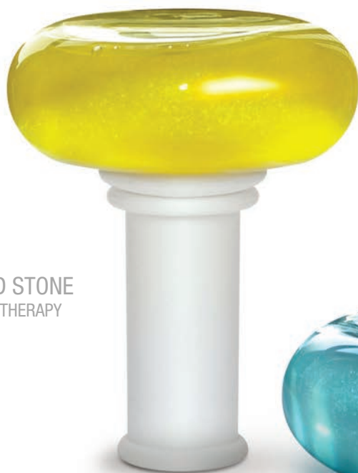
GOLD STONE HOT THERAPY