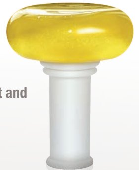
GOLD STONE E5103

The HEAT helps muscle relaxation and gives a regenerating effect on the emotions.