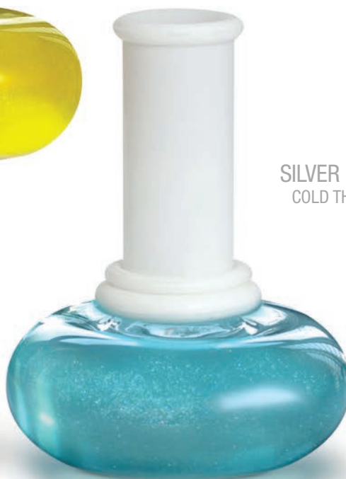
SILVER STONE COLD THERAPY