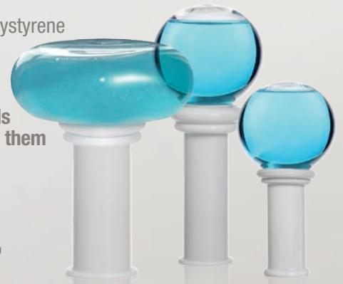
SILVER STONE E5104

A full and extend “CRYO” effect that revitalizes, tones and refreshes.